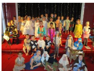
Foundation and Y1 Nativity Performance